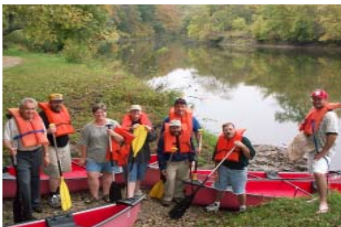
38 gather at CQH for the Fall Pastors Retreat. Pastors and spouses enjoyed canoeing, hiking, golfing, mountain biking and of course worshipping and spending time together in fellowship.