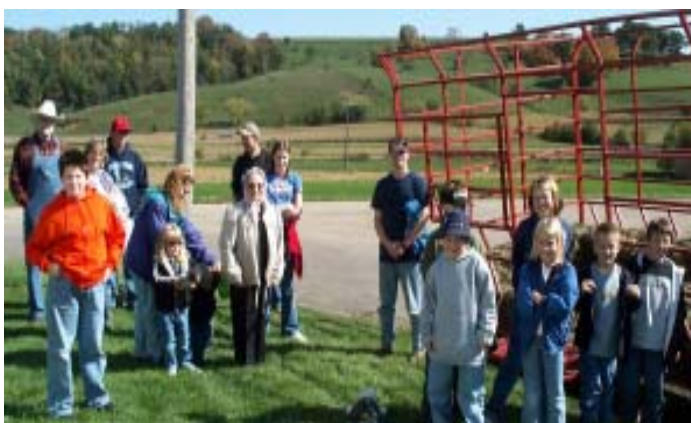
Members of the Winneshiek Quarter take time for a hay rack ride.

It is amazing that when Jesus faced a world fallen from the glory of God, He not only knew that the answer they needed was the good news of the Kingdom, but also believed that the earthling disciples, despite their weaknesses and even failures, could be agents of the great restoration news of the Kingdom of God. He trusted them and committed them to take over the work from Him and to do it effectively. By this act Jesus, the Son of the living God affirmed God's love for men (sic) and His ability to transform men and women from self centered evil to effective carriers of the gospel. Because of Jesus, Christians have the capacity in Christ to make a significant contribution. Most humanitarian organizations depend on human ability and wisdom, but Christians depend on the strength the God gives.