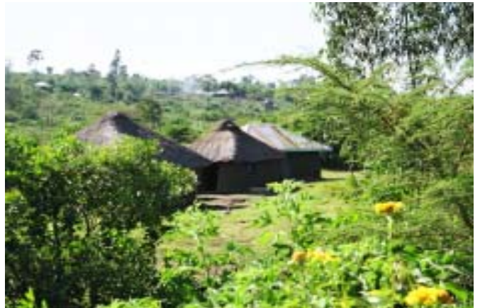
Shamba (house) outside of Kisumu, Kenya.