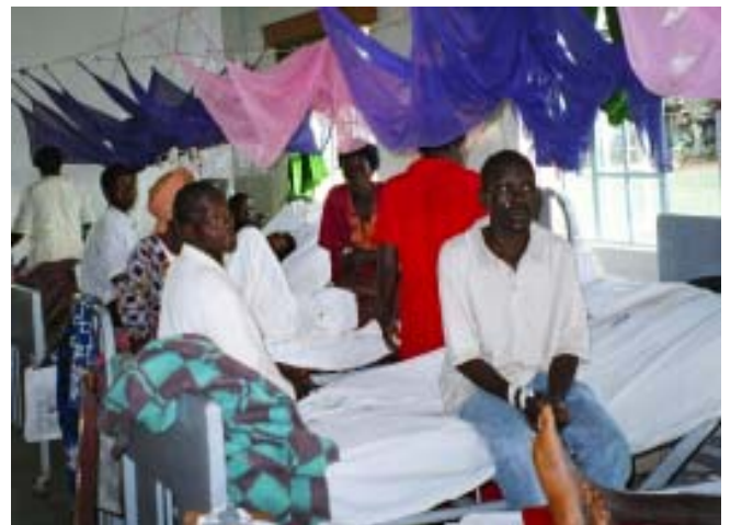
Surgical ward, Lugulu Hospital.

IAYM Ministry Conference August 12 & 13, 2005 Camp Quaker Heights