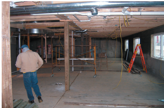
Work is being done to finish the basement of the Tall Oaks Lodge