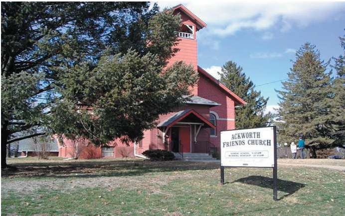
Ackworth Friends Church...Our location for Spring Body.