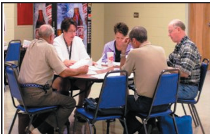
One of many board meetings