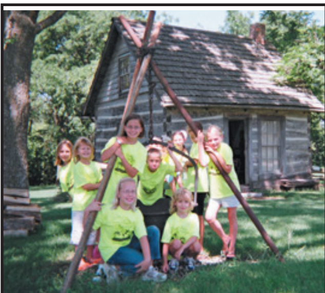
Children's Yearly Meeting on one of their field trips