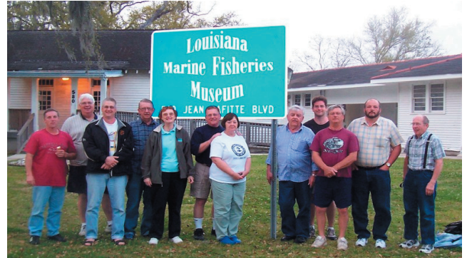
Our Friends from Iowa Yearly Meeting in Lafitte.