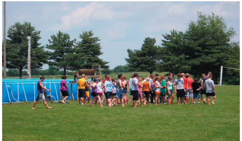
Senior High camp at Camp Quaker Heights

It's Camping Season for Iowa Yearly Meeting and Mesquakie Friends Center