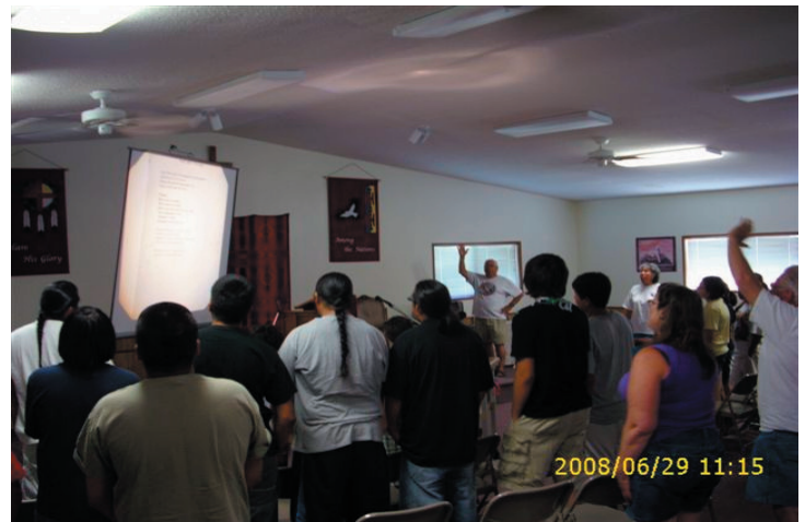
Pictures taken at the Soaring Eagles Camp at Mesquakie Friends during the last week of June.