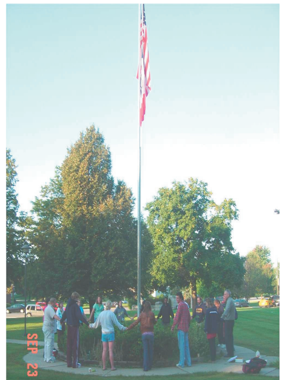
See You at the Pole - 2009