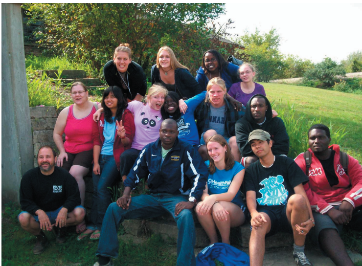
William Penn Students with me at InterVarsity's Fall conference

Our emphasis for the year is taken from Romans 1:1: "Becoming servants and apostles, set apart for the gospel."