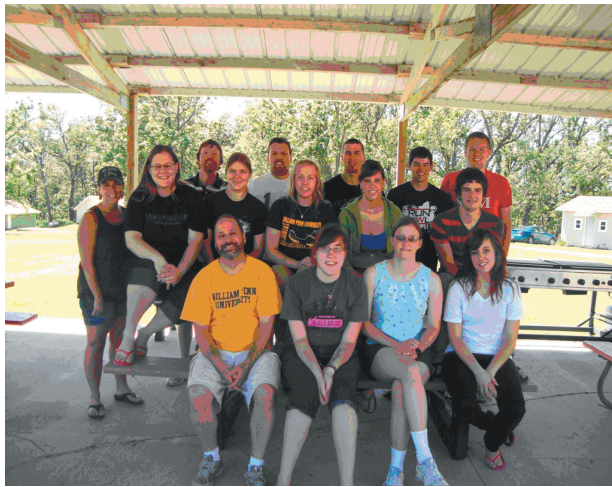
College Weekender at Camp Quaker Heights