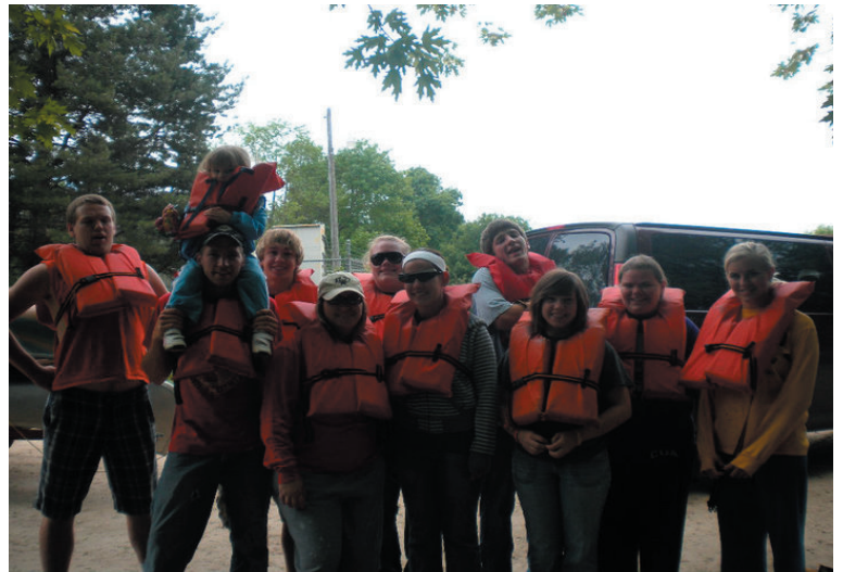
Staff members preparing for boating!