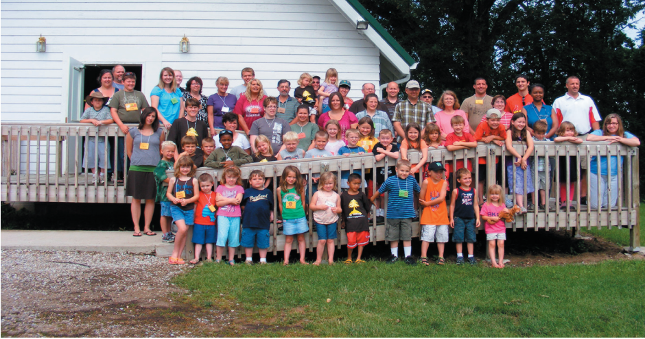
Little Fry Campers with their adult friend!