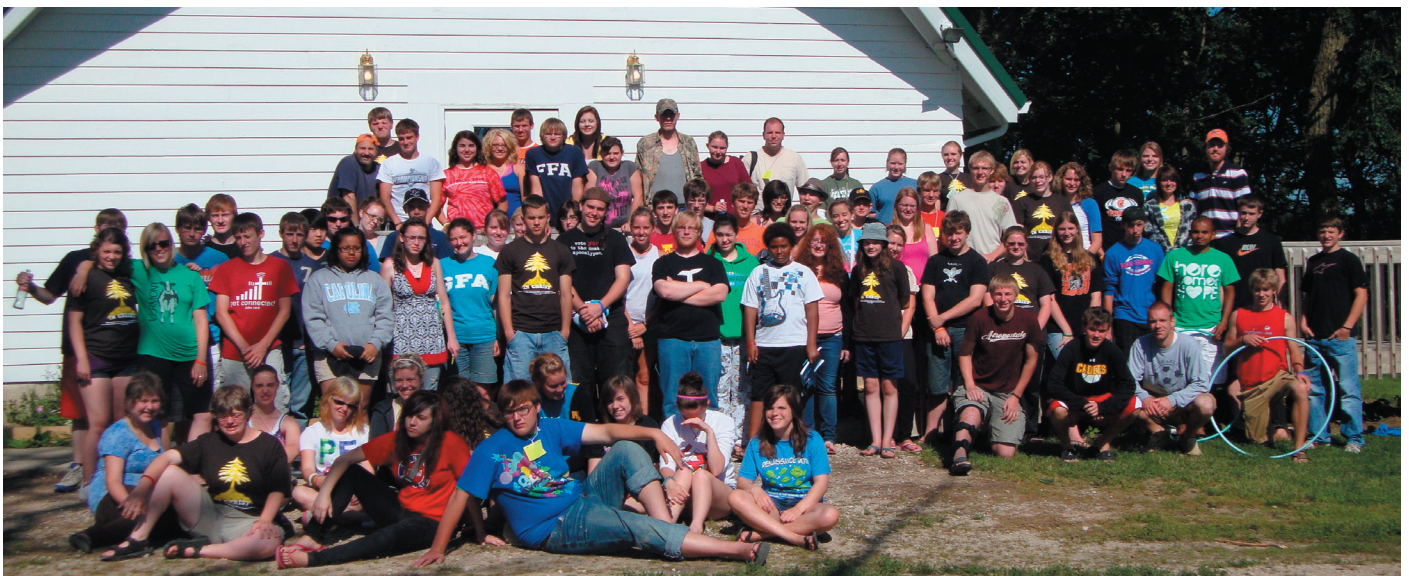
High School Camp!