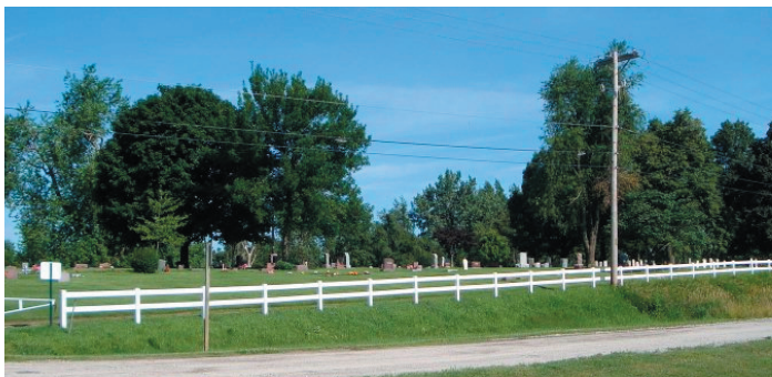
Oskaloosa's Friends Cemetery