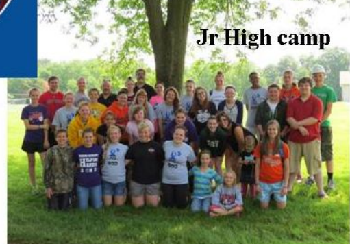
Jr High camp